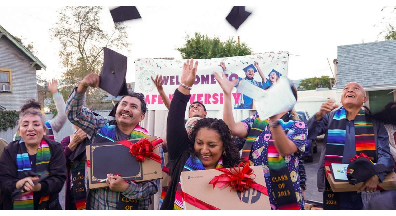
Pictured: Participants from our Technology Classes in Spanish receiving new computers upon graduation from the program.